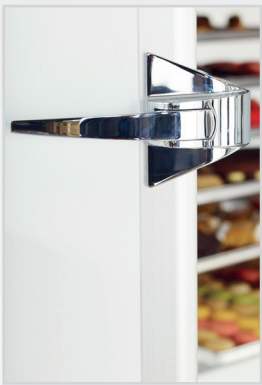
Adjustable, high-strength chromium handles and hinges