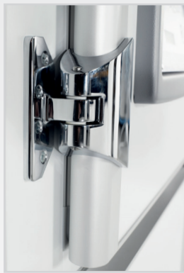
Doors reinforced and stiffened by aluminum profiled sections