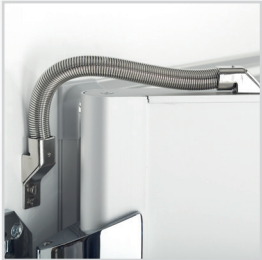
Control cable in a very reliable metal duct