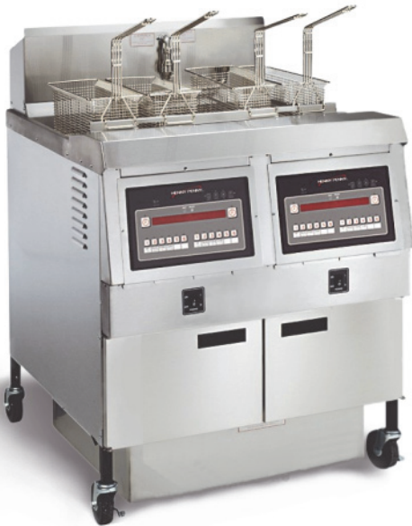
OFG 322 2-well gas open fryer with Computron™ 8000 control

Henny Penny open fryers offer high-volume, integral multi-well frying with programmable operation, oil management functions and fast, easy filtration.